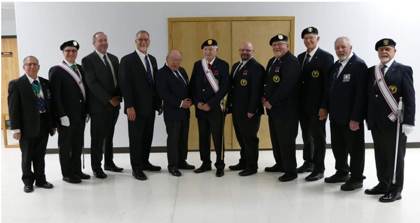
Above: The 4th degree team along with the marshals attending the Cortez 3rd degree.