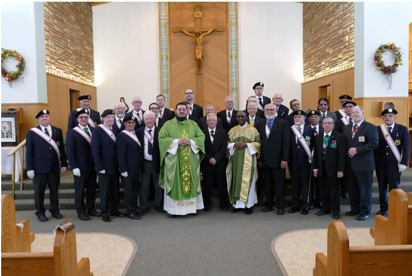
Above: Class picture from the Cortez 3rd degree.